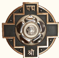
SHRI HALLY WAR